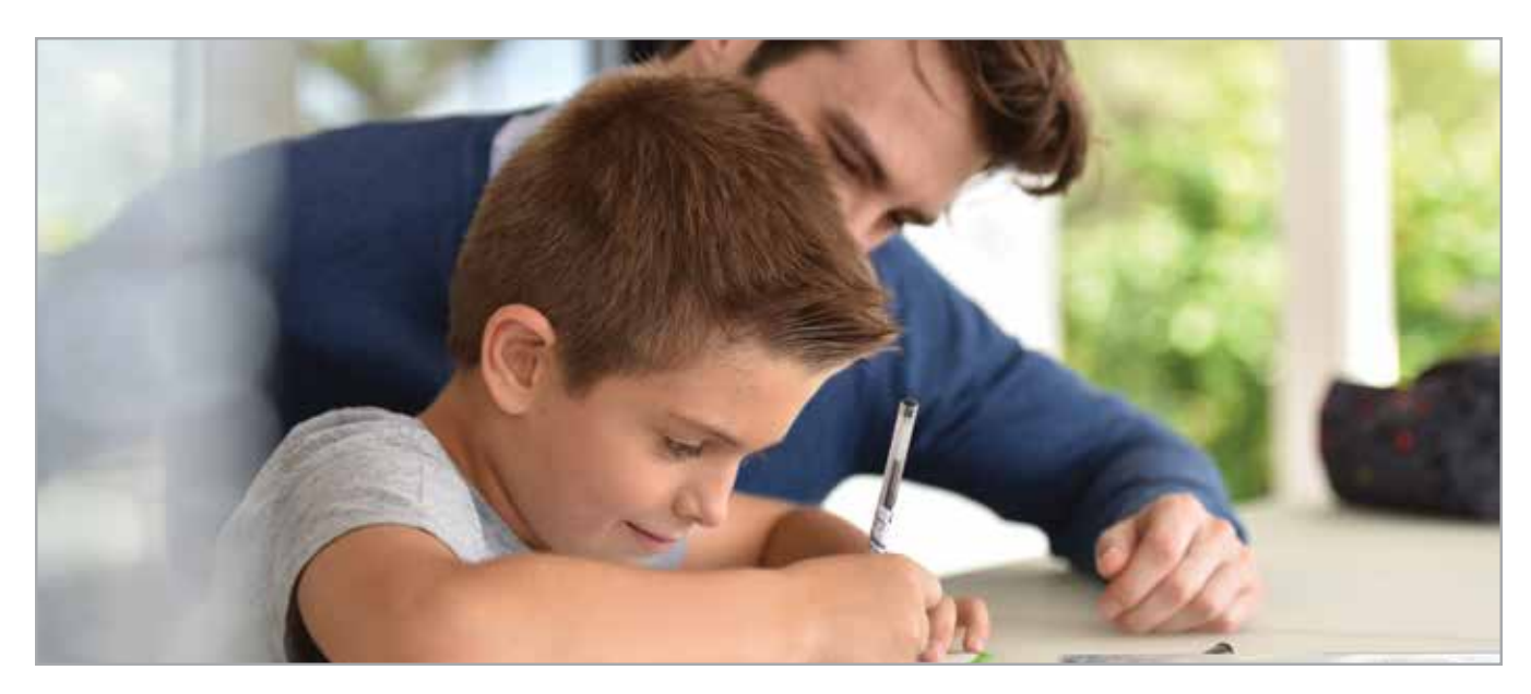
This list is not exhaustive. Inclusion in this guide does not imply endorsement by the North Dakota Child Sexual Abuse Prevention Task Force.