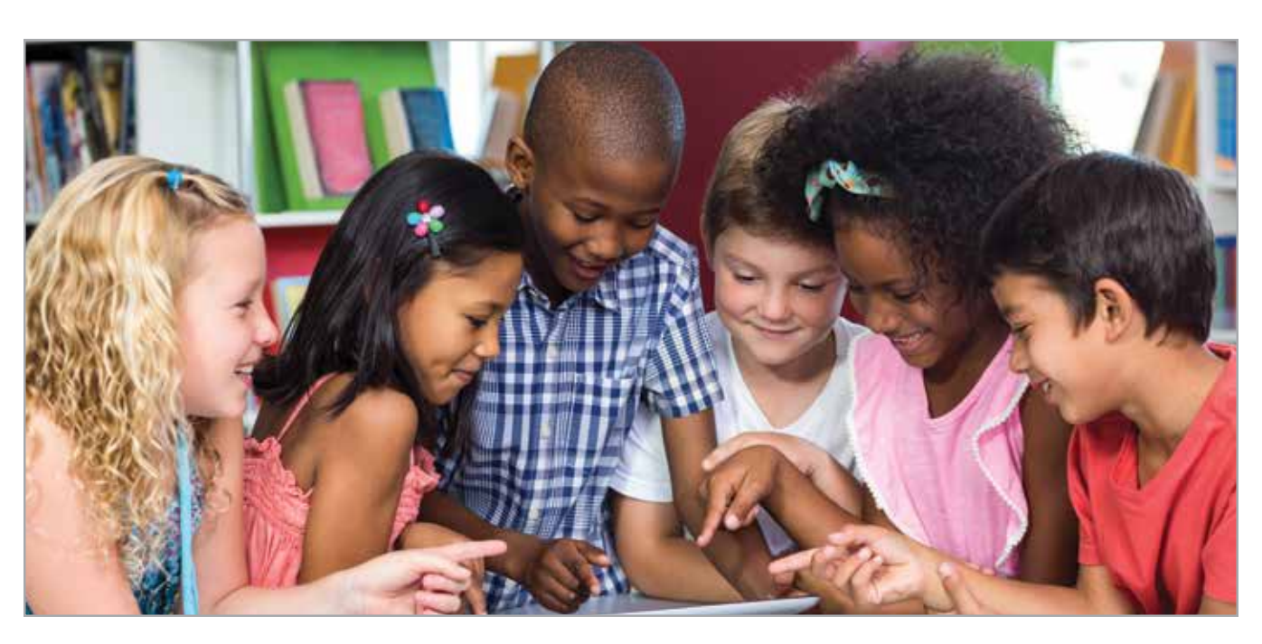
This list is not exhaustive. Inclusion in this guide does not imply endorsement by the North Dakota Child Sexual Abuse Prevention Task Force.